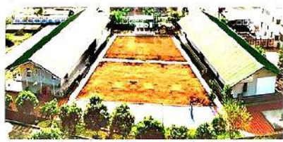
गोंडवाना विद्यापीठात विज्ञान आणि तंत्रज्ञान संसाधन केंद्र निर्माण केले जाते.

३ वैज्ञानिक ज्ञान, कौशल्य आणि तंत्रज्ञान या क्षेत्रांमध्ये मानवी क्षमताविकास सक्षमीकरणसाठी शैक्षणिक कार्यक्रम तयार करणे, संशोधन आणि नवोपक्रमाद्वारे शैक्षणिक-शैक्षणिक संशोधन आणि विकास सुलभ करणे, आदिवासी भ्रम टिळा जात आहे.