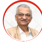
Padma Vibhushan Dr. Anil Kakodkar Chairman, RGSTC, Mumbai

A centre of excellence for sustainable value creation, conceived and funded by Rajiv Gandhi Science and Technology Commission (RGSTC), Mumbai, Govt. of Maharashtra.