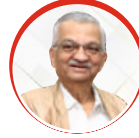
Padma Vibhushan Dr. Anil Kakodkar Chairman, RGSTC, Mumbai

A centre of excellence for sustainable value creation, conceived and funded by Rajiv Gandhi Science and Technology Commission (RGSTC), Mumbai, Govt. of Maharashtra.