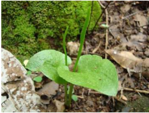
Ophyoossum reticulatum (Common name: Adders tongue fern)