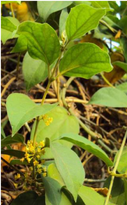
Gymnema sylvestris (Common name: Gudmar)