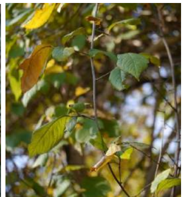
Embelia ribes (Common name: Vidanga)