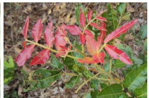
Schleichera oleosa (Common name: Ceylon oak)