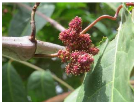
Ampelocissus latifolia (Common name: Wild grape)