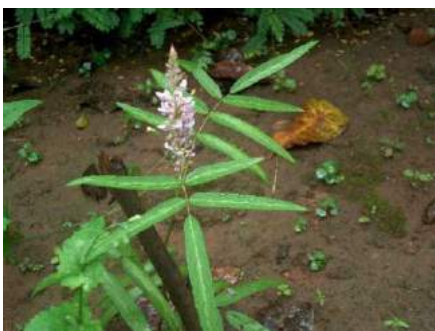
Uria picta (Common name: Dabra)