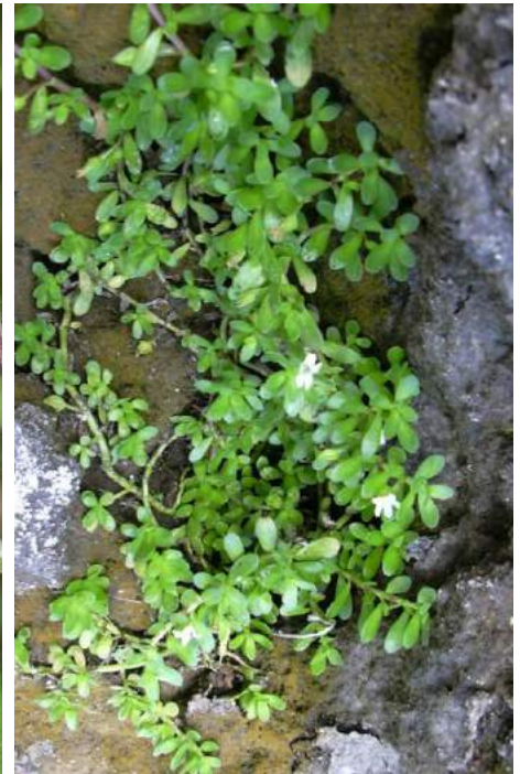
Bacopa monnieri (Common name: Herb of grace)