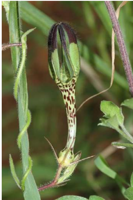
Ceropegia hirsuta (Common name: Hairy ceropegia)