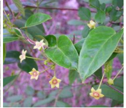
Tylothora indica (Common name: Indian ipecac)