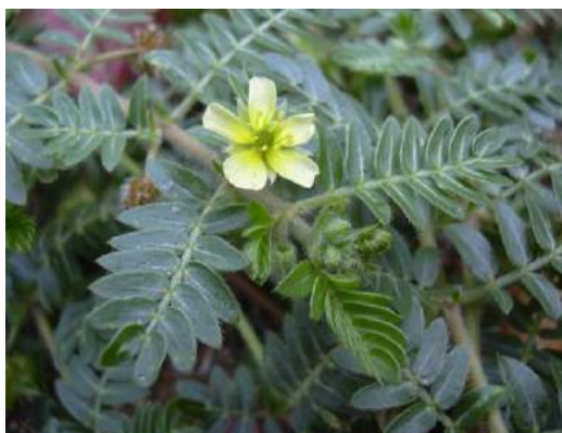
Tribulus terrestris (Common name: Puncture vine)