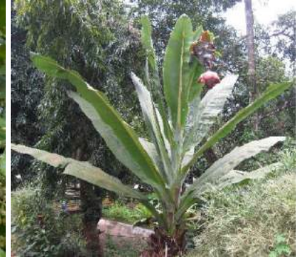
Encete superbum (Common name: Rock banana)