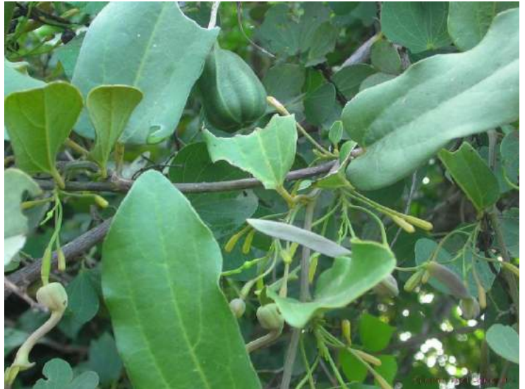
Aristolochia indica (Common name: Indian birthwort)