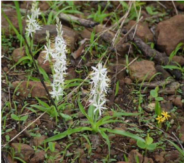
Chlorophytum borivilaium (Common name: Safed Musli)