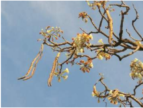
Radermachera xylocarpa (Common name: Padri tree)