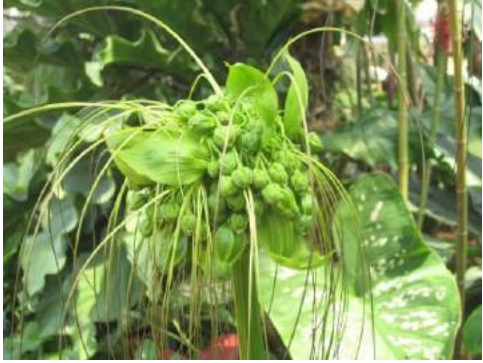
Tacca Leonpotoetaloides (Common name: Bat flower)