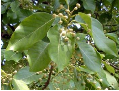
Litsea glutinosa (Common name: Lenza)