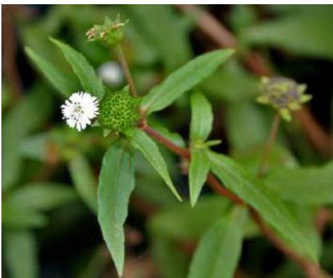
Eclipta prostrata (Common name: Bhrungraj)